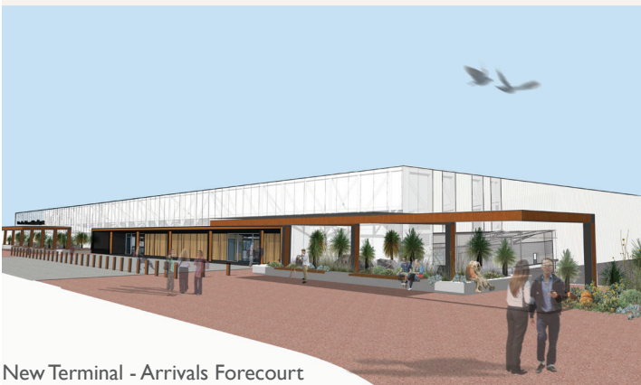
New Terminal - Arrivals Forecourt

The Busselton-Margaret River Airport Development Project is an exciting project for the City of Busselton and South West region. Once completed, the airport will be capable of facilitating direct interstate and international flights to destinations including Melbourne, Sydney, Denpasar and Singapore.